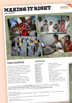
Making it Right poster Resources 1-12 Photos 01-13 Photo stories 1-13